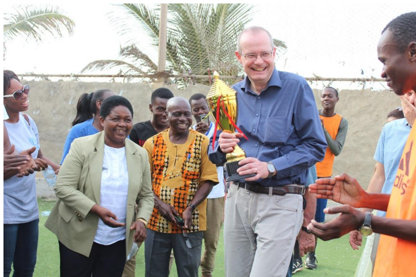
Football match between UNHCR staff, the German Embassy and OFADEC against DAFI students on 2 December 2017 during the DAFI scholarship celebration. The German Ambassador giving the cup to the DAFI team.