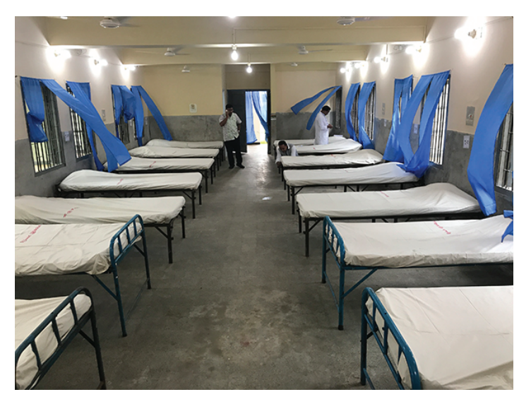
UNHCR supported Teknaf Health Complex (Gov Hospital) to expand their inpatient bed capacity with 16 beds by renovating.

Oral cholera vaccines are distributed with the help of volunteers, NGOs and the UN at Balukhali refugee camp.