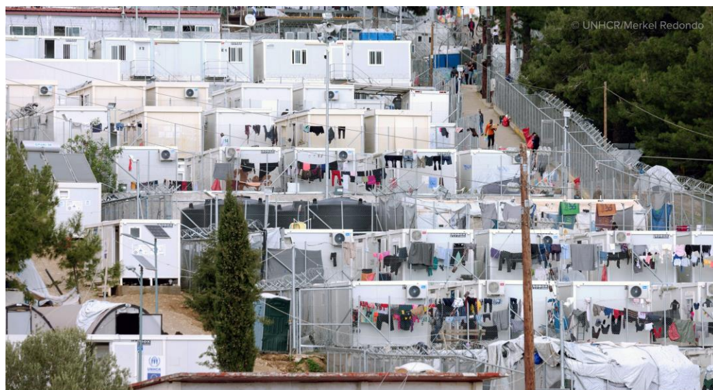
Asylum-seekers face overcrowded conditions at the reception centre of Vathy, Samos Island, Greece.

6 Island Offices in Lesbos, Chios, Samos, Leros, Kos, and Rhodes