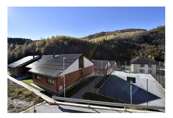
Asylum Center in Trnovo

UNHCR in partnership with Vasa Prava BiH and Bosnia Herzegovina Women's Initiative Foundation (BHWI) and their network of offices throughout the country, provides assistance to asylum seekers, refugees and persons in need of international protection in BiH. UNHCR also supports the Ministry of Security (MoS) and the Ministry of Human Rights and Refugees (MHRR), with respect to their role in accommodating asylum seekers and refugees by contributing to operational costs of running the asylum centre in Trnovo (managed by MoS), and the Refugee Reception Centre in Salakovac (managed by MHRR). These key and longstanding partnerships have since the beginning of this year, ensured basic protection including legal assistance, psychosocial support, and access to the asylum procedure for 125 persons in need of international protection in 2018.