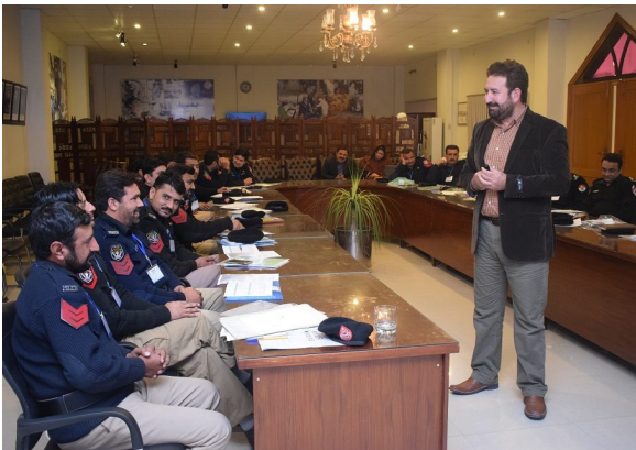
UNHCR arranged a session with police officials in Peshawar. The session focused on the UNHCR mandate, operation and the status of refugees in Pakistan.

The old landowner of Khurasan refugee village has sold the land and the new owner offered compensation to the Afghan refugees to relocate. There are some 30 families remaining who are seeking Commissionerate of Afghan Refugee's assurance of an appropriate alternate location. UNHCR is coordinating with CAR to identify an alternate location for these families.