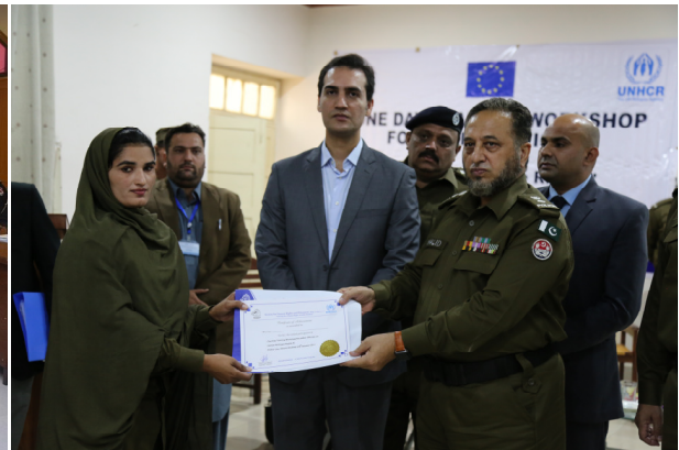
UNHCR conducted a one-day training session for police officers in the district of Bhakkar, Punjab with one of UNHCR's partners, the Society for Human Rights and Prisoners' Aid (SHARP).