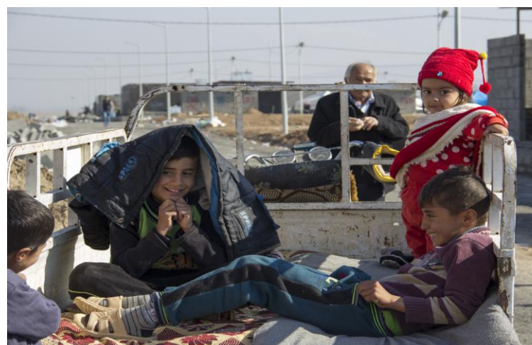
Domiz-2 camp, Duhok

2018 Basic Needs Sector plan: Preparations for the 2017-18 winter assistance programme have begun, with an emphasis on the provision of cash to both refugees in and outside of camps. In the framework of the 3RP plan, four agencies; namely UNHCR, UNICEF, IOM and PWJ are preparing to appeal for some $33 million to cover the needs of the sector over the period 2018-19. The objectives are to cover refugees' basic requirements as they arrive or through seasonal support, while dedicating special attention to the needs of women and children.