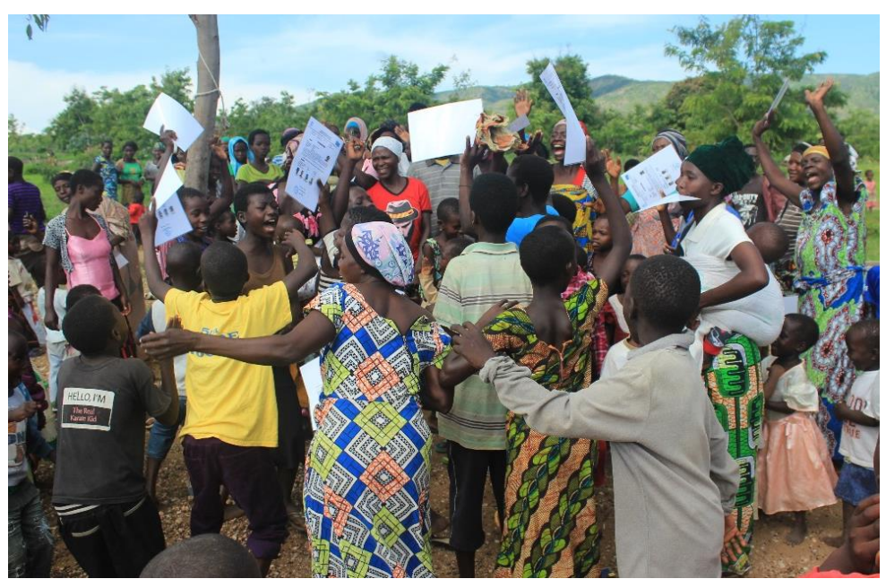
Burundian refugees celebrate their transfer to the new site of Mulongwe.