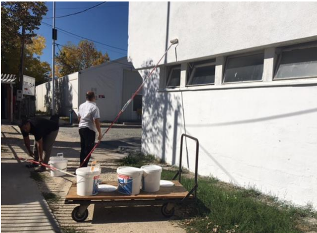
Refugees whitewashing the Registration Hall with paint provided by the SCRM, Presevo (Serbia), ©UNHCR, 12 October 2017