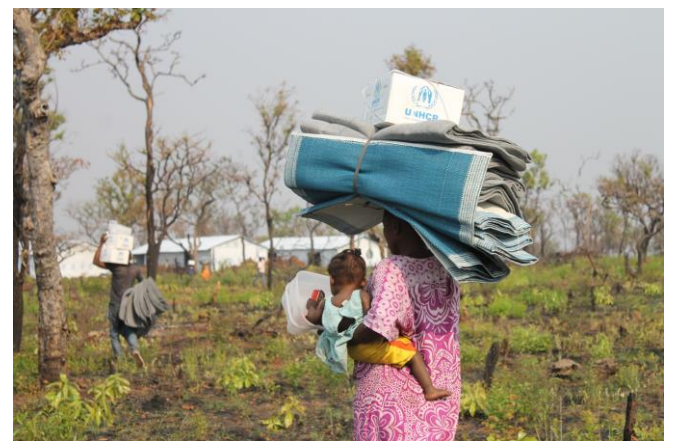
Core relief items distribution in Lóvua, upon relocation of families to the settlement.