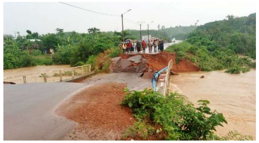
Bridge in San Pedro area, south west of Cote d'Ivoire, affected by the heavy rains.