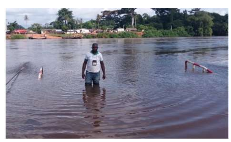
Cavalla River, used to cross from Duokodi (Liberia) to Prollo (Cote d'Ivoire).

As of 31 July 2017, 26,004 refugees have been repatriated since the resumption of the repatriation programme on 18 December 2015. This number includes 40 Unaccompanied Minors (UAMs) who returned home in collaboration with the International Committee of the Red Cross (ICRC).