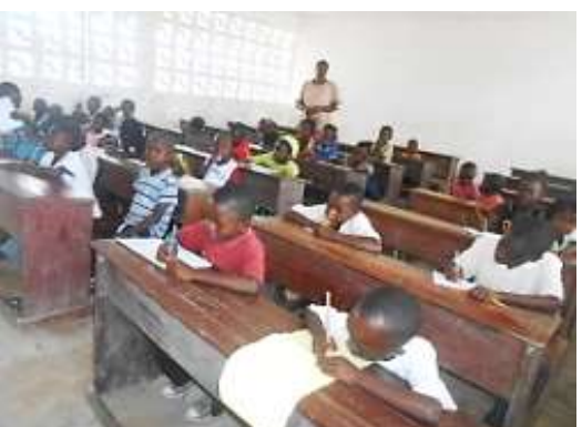
Left: Students received their report cards at the closing ceremony of the 2016/2017 academic year. Right: The Summer School Programme in Bahn High Extension School opened on 17 July 2017.