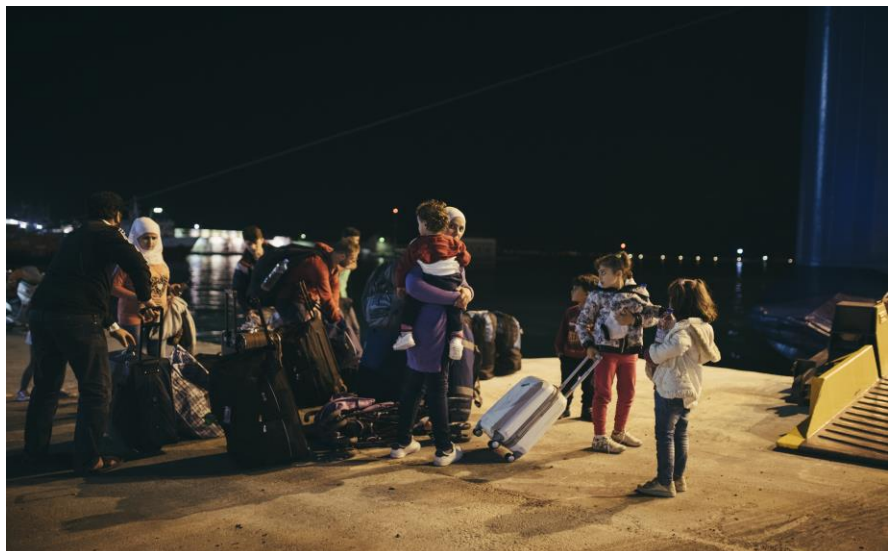
Syrian refugee families board a ship taking them from the island of Chios to a new facility on the Greek mainland.

1 Islands Unit in Athens 1 Sub Office on Lesvos 5 Field Offices on Chios, Samos, Kos, Leros and Rhodes