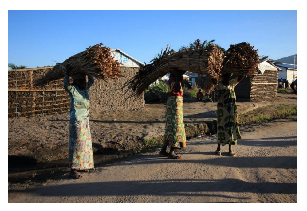
Women in Lusenda Camp carry firewood back to their homes.