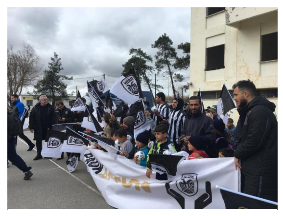
PAOK FC with refugees in Alexandria site where they brought winter clothes and gifts.

PAOK FC made an in-kind donation of winter clothes (isothermal shirts, underwear, gloves, beanies and sweaters) to cover the most urgent needs of people of concern in northern Greece during the cold weather. The donated items by PAOK FC were greatly appreciated by the refugees in the sites of Alexandria and Nea Kavala.