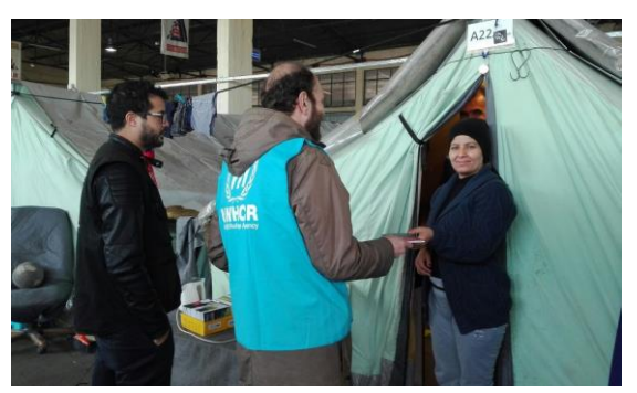
Distribution of mini-lexicons in Derveni site.

Thessaloniki, and the NGOs Praksis, Arsis, Solidarity Now, Intersos, Iliaktida, and Catholic Relief Service (CRS) and funded by the European Commission.