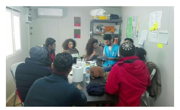
Roundtable discussion during the Participatory Assessment at Softex site in cooperation with IFRC and Save the Children © UNHCR/ February 2017

• The assessment reflects the problems, gaps, challenges and solutions as expressed by the persons of concern. The majority highlighted the need to have more tailored ways of communication rather than leaflets or posters which many women and elderly are not able to read. Without proper information and guidance available, female refugees remain fully dependent on the men of their community. Refugees also report reduced access to information due to the lack of interpreters, especially when it comes to the smallest communities (e.g. Pakistanis, Somalis). People highlighted the need to create communication channels between the Regional Asylum Offices, Embassies and persons of concern for a better flow of information. Finally, most refugees seem to require further information on their rights. They also want to receive further clarification regarding the asylum procedure, preferably by UNHCR, which they consider a trustworthy source. Currently they rely primarily on fellow refugees and social media for information.