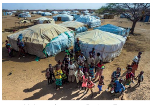
Malian refugees in Burkina Faso

Voluntary return and reintegration are the key solutions and resettlement is used as a protection tool. In total, there are over 57,000 Malian refugees returned according to the Government of Mali. The Commission de Mouvement de Populations registered 814 persons who voluntarily returned to Mali between January and February 2017, despite the volatile security conditions that do not permit for an organized return.