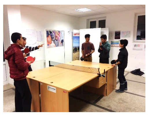
Boys playing table tennis in RC Preševo (Serbia), @UNHCR, 28 February 2017