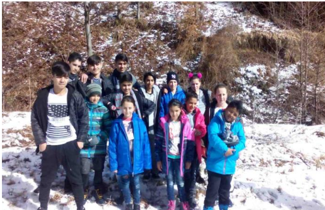
Refugee and IDP children at International Winter Camp for children, Kopaonik (Serbia) @Amity, 26 February 2017