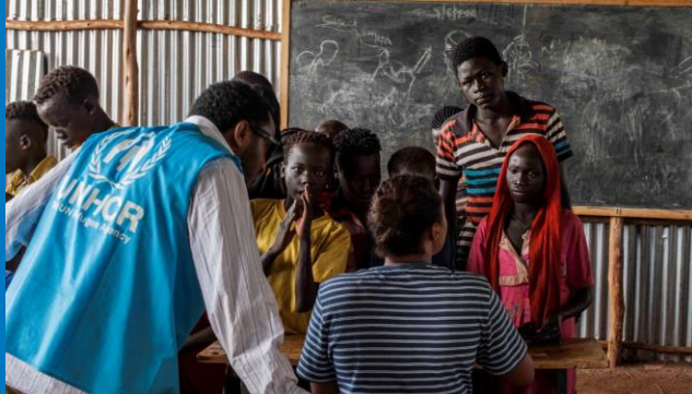
Refugee children in the Tsore refugee camp register for the next school year.