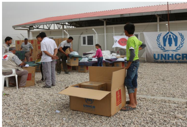
Distribution of summer items in Domiz Camp, Duhok.