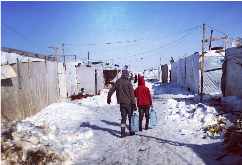
Syrian refugees carry water to their shelter after distribution

December marked the completion of several water projects in Lebanon, including in Akkar (the Bsartine water treatment plant serving 2,500 individuals) and Kfartoun (a borehole pump-station and 1.4 km of pipeline benefitting 4000 individuals). In Mount Lebanon, the completion of 6 village water reservoirs serving a total of 38,118 Lebanese and 9,046 Syrian Refugees were completed and connected to the Water Establishment networks. At a household level, water filters were distributed in Beirut Mount Lebanon to 103 families and in Marjeyoun to 39 families. A total of 6,624 people benefited from new latrine construction in December. Additional populations benefited from latrine dislodging. There were over 100,000 beneficiaries of communal waste-water systems. These projects were carried out with 6 partners, and ranged from small initiatives in informal settlements to large projects in villages. Water quality issues in several locations were apparent, specifically regarding nitrate and phosphate contamination. There were also concerns over biological water quality, for which agencies are procuring water quality test kits. Investigations are under way over concerns regarding the contamination of water networks due to old piping that is permitting sewage.