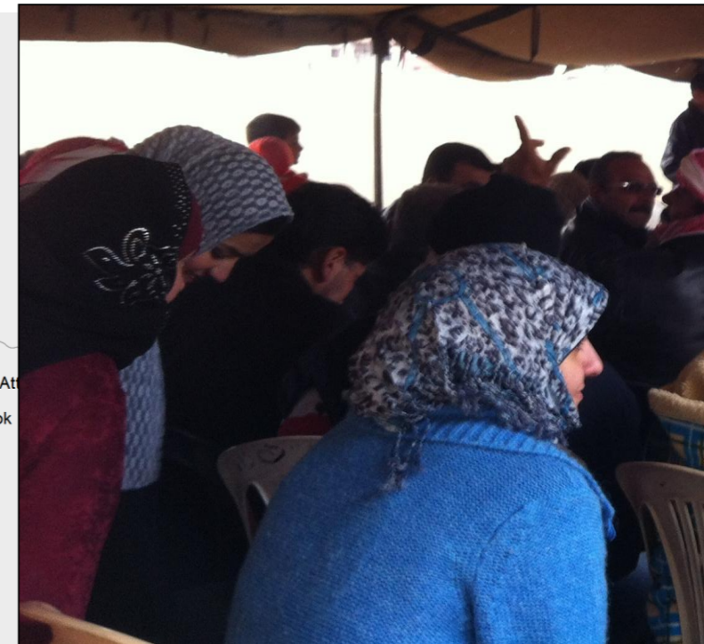
Registration with the municipality is being conducted regularly to ensure that new arrivals can access assistance Aarsal 2013-11-29