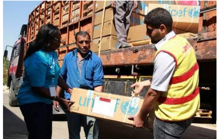
UNICEF, in cooperation with the Ministry of Education and other partners around Syria, is supporting a Back to Learning campaign that will distribute school bags with stationery supplies to one million children in all of Syria's 14 governorates.

Communities are being reached with advocacy messages through radio and other print and broadcast media, billboards, posters and flyers. Messages focus on raising awareness on the value of education and the start of the school year to encourage children to resume their education. Around 1,700 billboards have been installed across Syria including in Damascus with the motto "Let's keep on learning. Learning is good for my present and future." Parents are being encouraged to register their children at their nearest school, even if education records are not available.