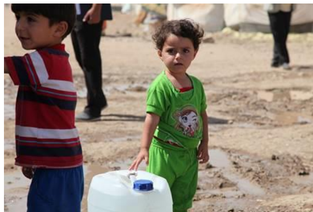
Kawergosk refugee camp, west of Erbil

In Qasrok camp (under construction), UNICEF and KURDs are installing water tanks, latrines, showers and water benches. UNICEF is also assessing Bersive and Batifa (Zakho) and planning the WASH response for Kandala Reception Centre and Gawilan Camp (both still under construction).