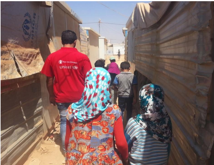
SCI Field Worker, conducting social mobilization in Za'atari

During the reporting period, UNICEF/IRC identified and registered 14 unaccompanied and 28 separated children in Za'atari. These cases are being closely followed up.