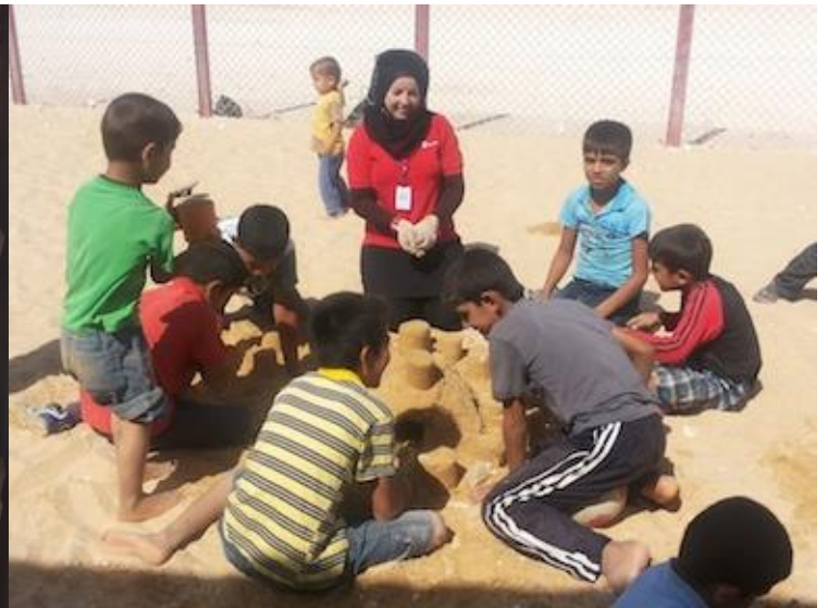
Children at a Za'atariCFS making sand castles