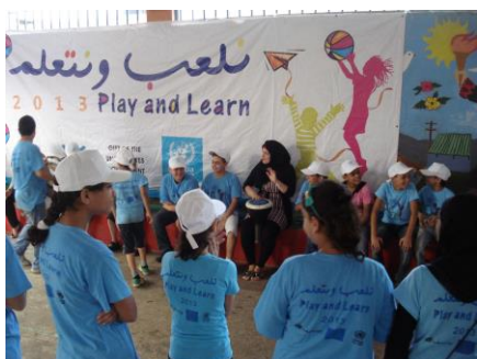
Play and Learn for PRS.

There are currently 93,000 Palestinian refugees from Syria (PRS) registered with UNRWA in Lebanon. The majority of households are living inside camps across all areas, with the influx concentrated within large camps (Ein El-Helweh, Rashidiyeh, Beddawi and Nahr el-Bared camp).