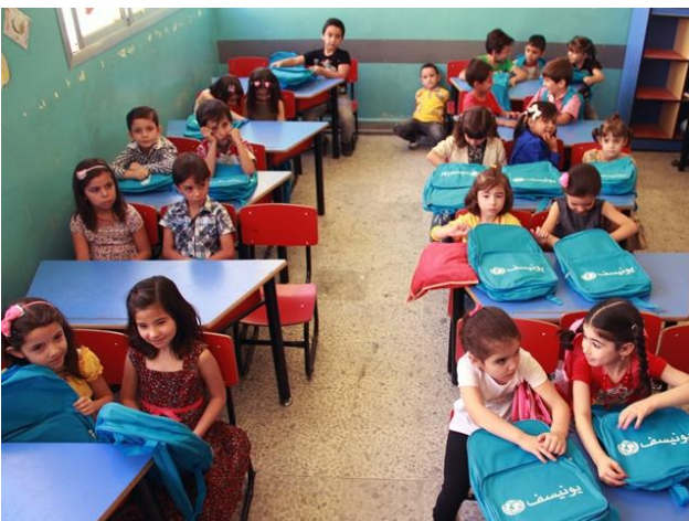
A class of first graders at a school in Damascus are ready for their first school year after receiving UNICEF school bags and stationery.

In addition, 5,000 blankets and 5,000 plastic sheets were dispatched for distribution to internally displaced people through the UNICEF convoy to ArRaqqqa.