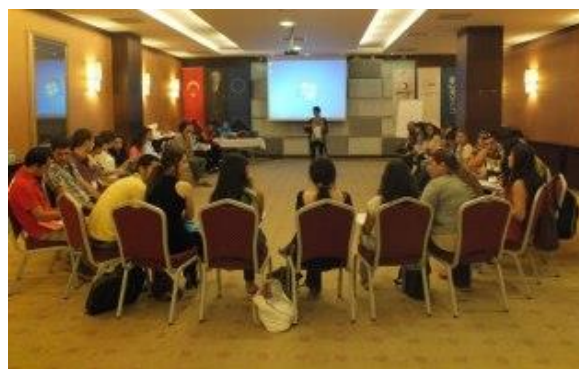
Youth worker training.

The second round of training for youth workers employed through the Turkish Red Crescent Society ran from 8 to 13 September in Gaziantep. Twenty-four youth workers and two administrative staff from the Turkish Red Crescent Society participated in the training led by Genclik Servisleri Merkezi (GSM), which was a follow up to the first training completed in July. This training focused on lessons learned the past two months; the implementation of activities for children and youth in the camps; communication skills; monitoring and reporting; and an introduction to child protection.