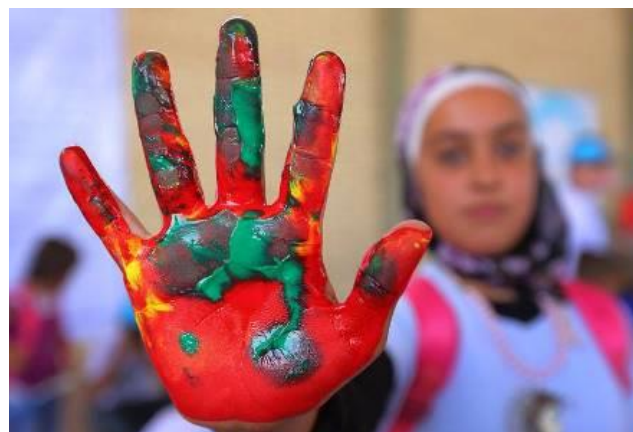
Syrian refugee girl showing off her painted hand she printed on a Back to School banner.

A total of 2,025 visits by children to the ACTED CFS/YFS (550 children registered) and UNICEF/DoLSA CFS/YFS (562 children registered) were reported in the past fortnight. Activities at the centres include sports, arts, crafts, computer lessons and catch up classes. Awareness raising and individual sessions with children and parents were also held. Save the Children is opening a new CFS in