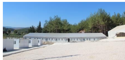
First UNICEF-supported prefab school ready for the new school year.