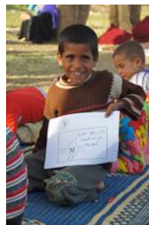
Hygiene promotion activities in tented settlements.

Water and sanitation interventions are being prioritized in Miniara and Minieh 1 tented settlements by UNICEF implementing partners, PU-AMI and Solidarites International, after a UNHCR health partner identified 58 severe cases of diarrhea in the settlement. UNICEF Health and WASH specialists also visited a Palestinian gathering in Ein El Hillweh to assess needs after Oxfam reported concerns regarding diarrheal diseases in the gathering. UNICEF supplies of aquatabs and soap were distributed to support UNRWA's response in the area. UNICEF is following up with implementing partners in the region to ensure continued health and WASH support to the area.