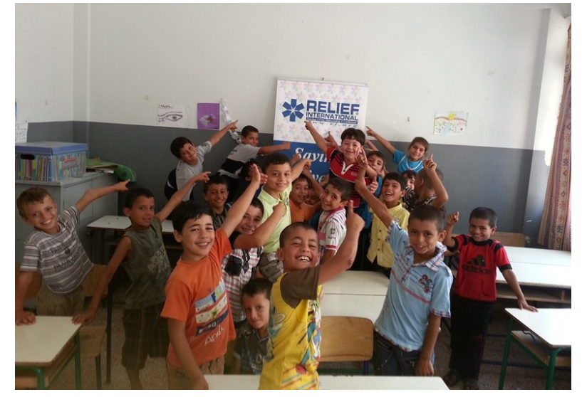
Young refugees in north Lebanon.

Due to the difficulties faced by many families in traveling long distances to the KCC, RI is planning the establishment of an additional five education centres in the Karak area to increase accessibility for vulnerable families to education assistance.