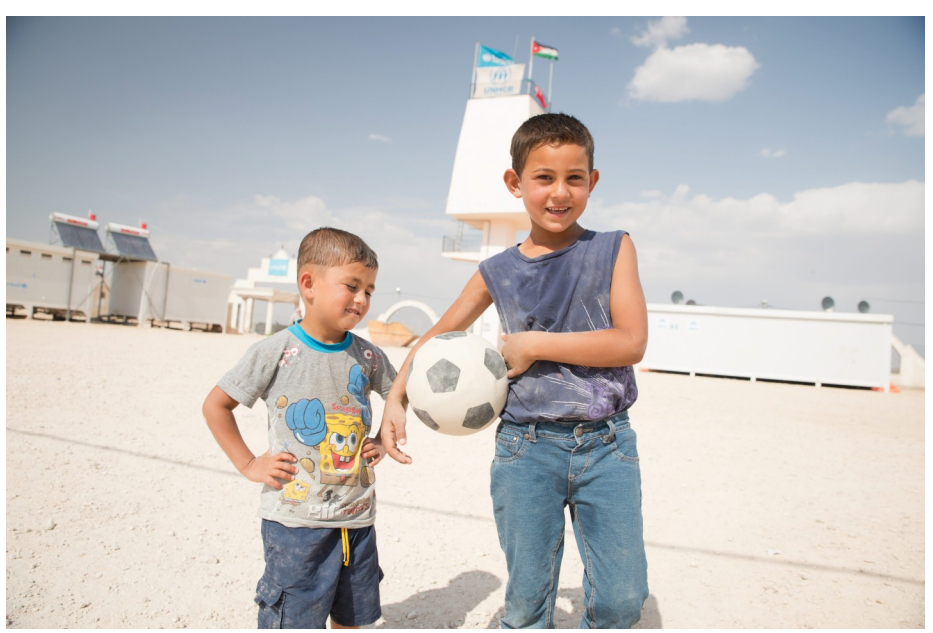
Young refugees play in an open area in King Abdullah Park, Jordan.

Turkey - The Turkish Red Crescent (TRC) with the support of UNICEF have completed orientation and training for 20 youth and recreation workers who have been deployed to 14 camps accommodating Syrian refugees across the country. The training - the first in a series to be carried out over the course of the 18 month programme - was also attended by ten social workers from the Ministry of Family and Social Policy who are already working in the camps. The new youth and recreation workers will mobilize youth volunteers and plan and implement recreational activities for young refugees, targeting 10,000 refugees aged four to 18 years old.