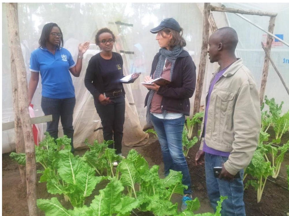
A two person delegation mission from European Commission Humanitarian Aid & Civil Protection (ECHO) accompanied by UNHCR Team Leader (left) during a visit to the Green House project on 19