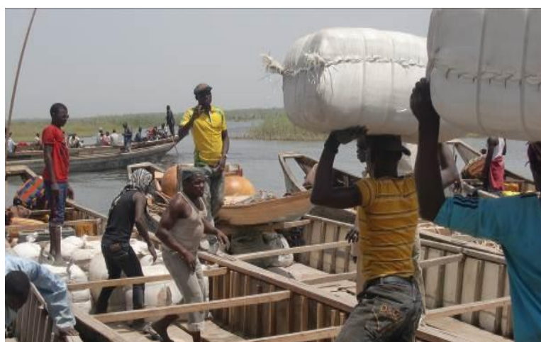
Distribution of basic relief items to Nigerian refugees on Lake Chad Islands: April 2014