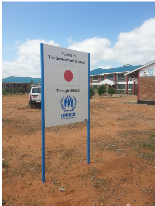
Ifo 2

11 persons of concern were charged under the Kenya Forests Management Act with illegal logging of trees in Alinjgur. Three others from Ifo camp faced similar charges. They were arrested by the Kenya Forestry Service officers and arraigned before the Dadaab mobile court. To strengthen refugee awareness of environment conservation and of regulations and penalties associated with the destruction of the environment, UNHCR, The Relief, Reconstruction & Development Organization (RRDO), Fafi Development Association (FAIDA), and RCK participated in a live radio program aired on Dadaab FM.