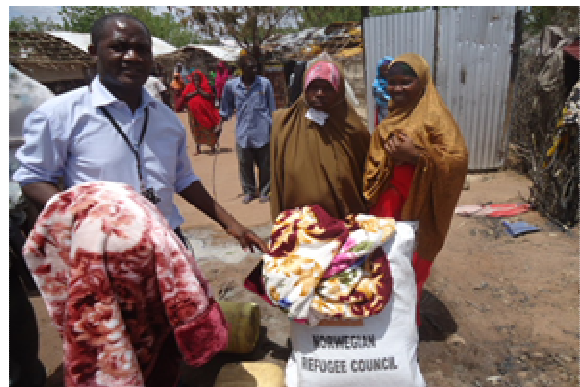
Support to fire victims

The month of October was marked by several incidents of fire in Hagadera. Altogether five blocks were affected and over 30 houses burnt down. The most probable cause of the fires was faulty electrical cables. The fires spread fast because of the strong winds prevailing during this time of the year, just before the start of the rainy season. Firefighting in the camps is made difficult by overcrowding and roads