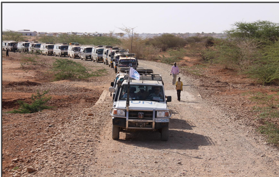
A relocation convoy from an earlier movement of refugees from the Transit Centre to Melkadida. A similar relocation of refugees from the Transit Centre to the newly opened Hilaweyn camp was launched this morning.