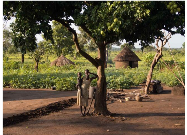
Since mid-December, Adjumani District has received the bulk of the South Sudanese refugees; prior to that it was hosting some 12,000.