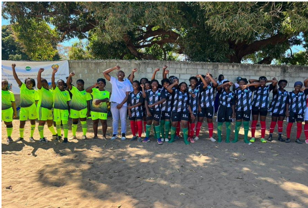
In Cabo Delgado UNHCR together with its partner AVSI organized a girl's football match in celebration of World Humanitarian Day

GBV Case management: To overcome community taboo regarding GBV, a psychologist and local guide were hired in Palma district to answer specific questions raised by the community on GBV during sessions with community volunteers.