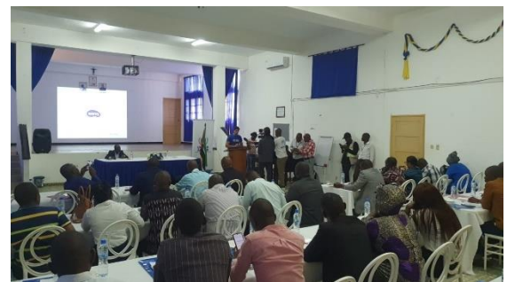
UNHCR supported a protection capacity-building workshop held on 26-27 July, in Pemba, to UNHCR’s Government counterpart in protection, the provincial department of gender, children, and social welfare (DPGCAS).

*Source: IOM/DTM Northern Mozambique Mobility Tracking Assessment Round 18 (April 2023)