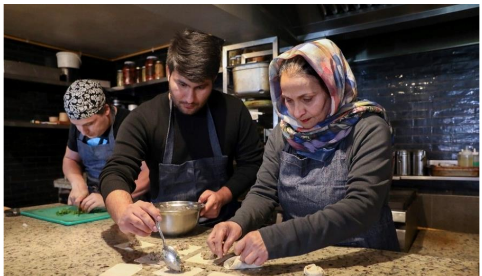
In frame of the World Refugee Day, UNHCR launched the second version of the national cookbook "Mi Mesa es tu Mesa: el sabor de compartir" which aims to promote diversity and the appreciation of the different cultures that coexist in Chile. More info https://mimesaestumesa.cl/ .

1 National Office in Santiago (Metropolitan region) 1 Field Unit in Arica (Arica and Parinacota Region) 3 Field Presence in Iquique (Tarapacá Region), Antofagasta (Antofagasta Region) and Puerto Montt (Los Lagos Region)