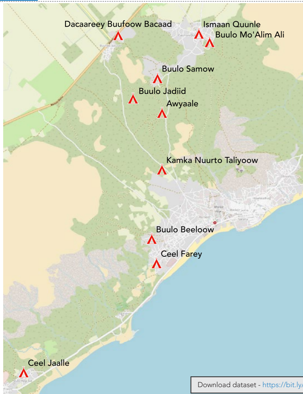
Map of verified IDP sites in Marka - May 2023