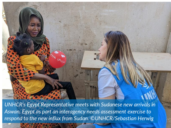
UNHCR's Egypt Representative meets with Sudanese new arrivals in Aswan, Egypt as part an interagency needs assessment exercise to respond to the new influx from Sudan.

Between 28 April and 1 May, the UN Country Team, in consultation with the Government of Egypt, sent a scoping mission led by UNHCR to Aswan and Abu Simbel. The UN Country Team assessed the situation on the ground through several discussions with newly entered Sudanese individuals and met with the Egyptian Red Crescent (ERC). The mission identified the most pressing needs and gaps for the provision of assistance, particularly in the first phase for those who recently entered and/or are still present on the Sudanese side of the border.