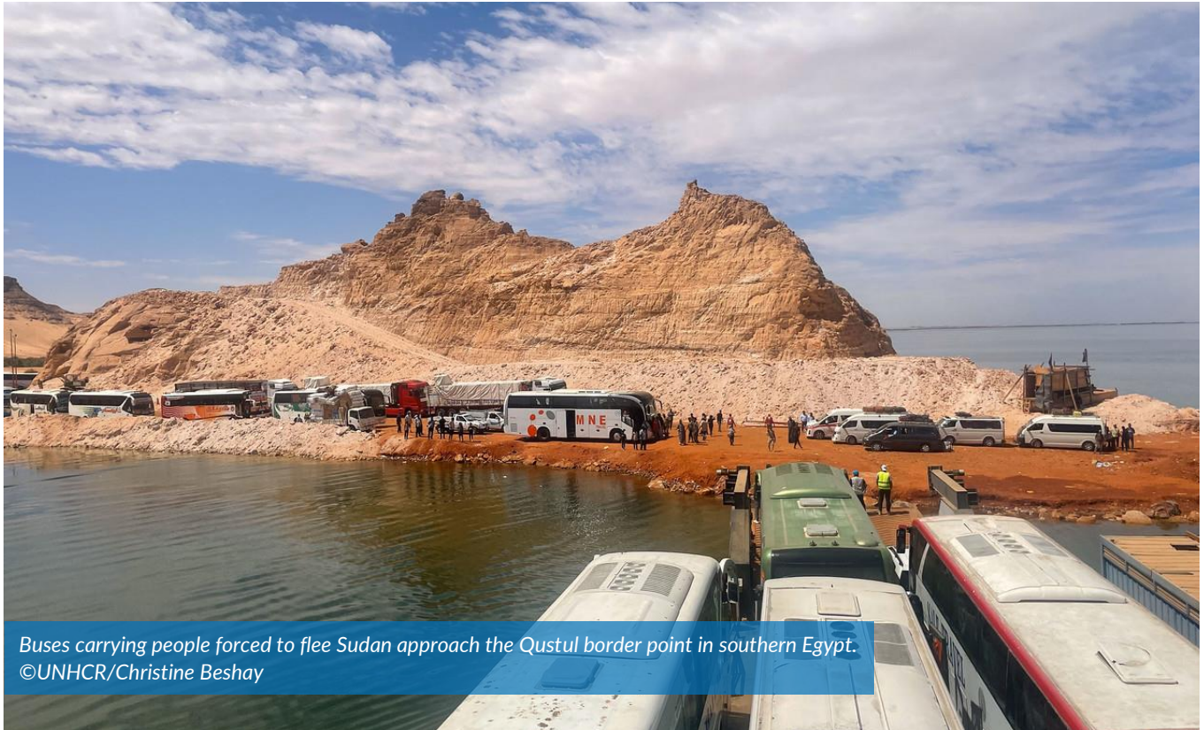
Buses carrying people forced to flee Sudan approach the Qustul border point in southern Egypt.