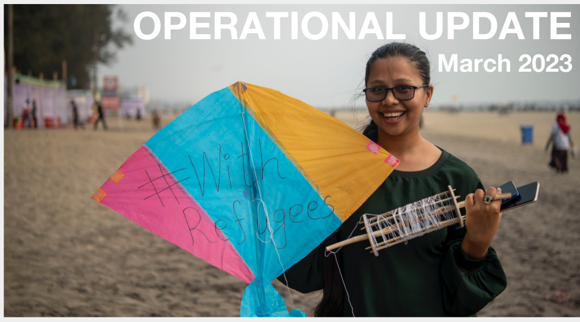
Kite festival organized by UNHCR on Cox's Bazar beach with messages of solidarity.

Support is additionally extended to host communities while continuously working towards solutions to ensure that refugees can return in a safe, dignified, voluntary and sustainable way once conditions in Myanmar allow.