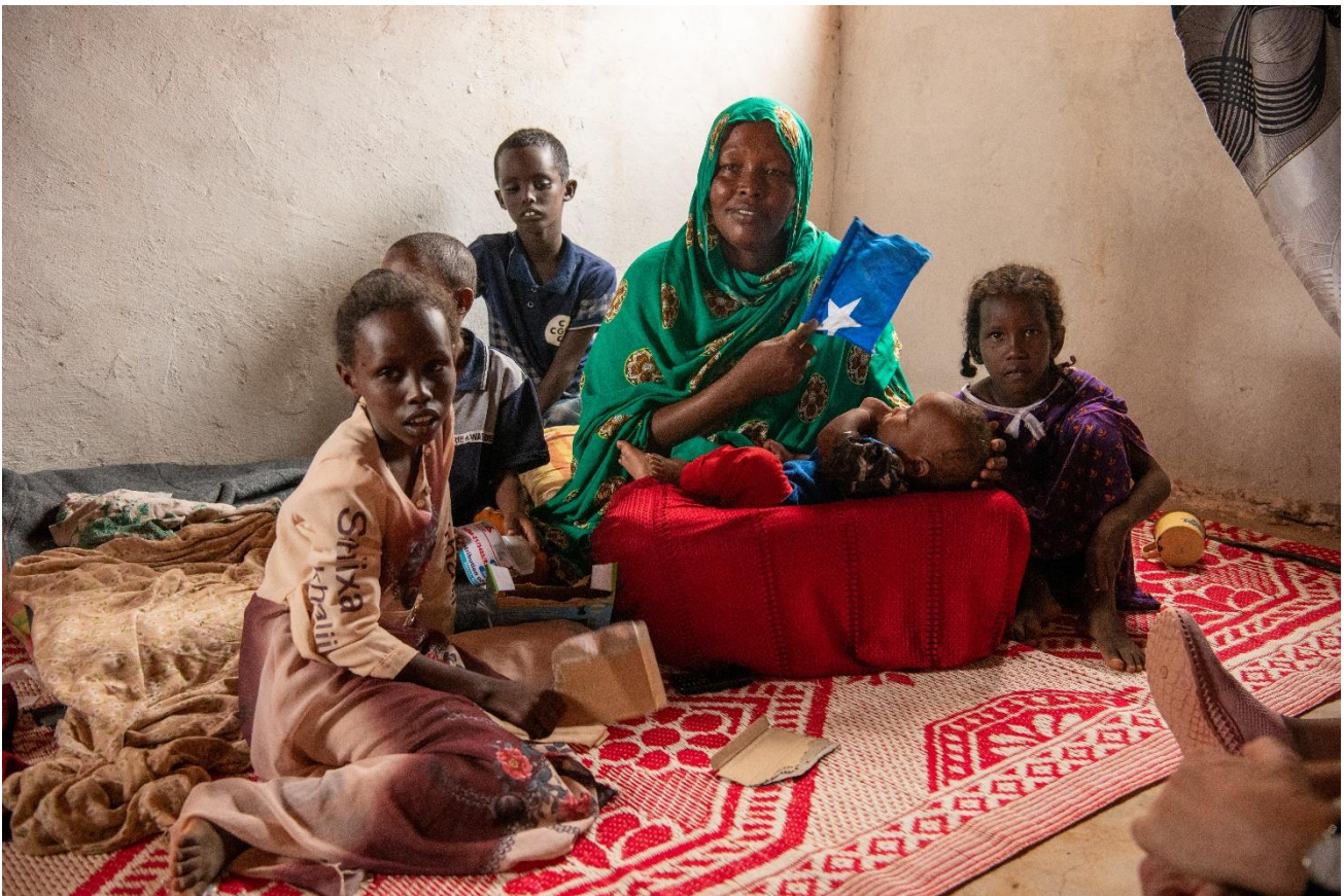
An internally displaced family at Qaboobe durable solutions site in South Galkayo, Somalia.