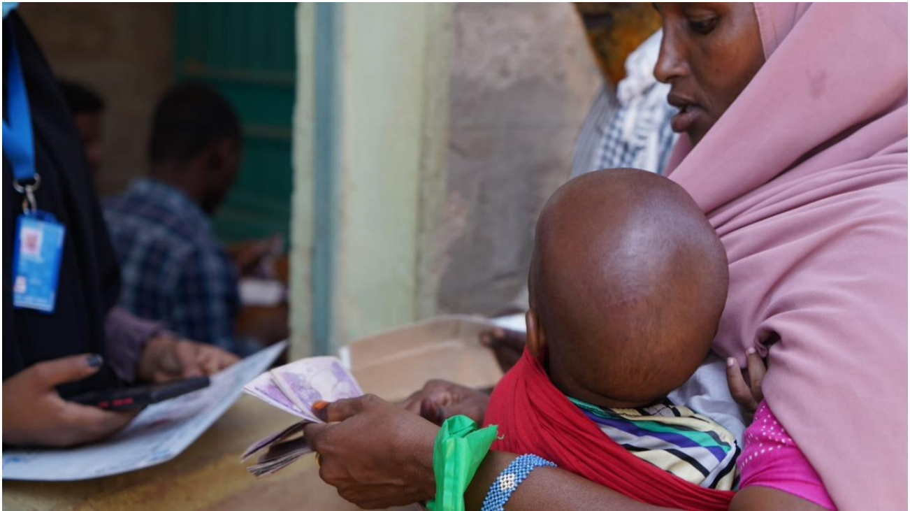
Following the drought as well as incremental food cuts, UNHCR has started providing cash for nutrition to reach a total of 4,137 refugee households to support the most vulnerable families that face food insecurity in the drought affected Liban zone of the Somali region of Ethiopia.

The cash will help them improve their living conditions and food security at household level. This intervention to the refugees targeted older persons at risk, person with disabilities, female heads of household taking care of children under 5 years old, children at risk, persons with serious medical conditions and survivors of Gender-Based Violence (GBV).