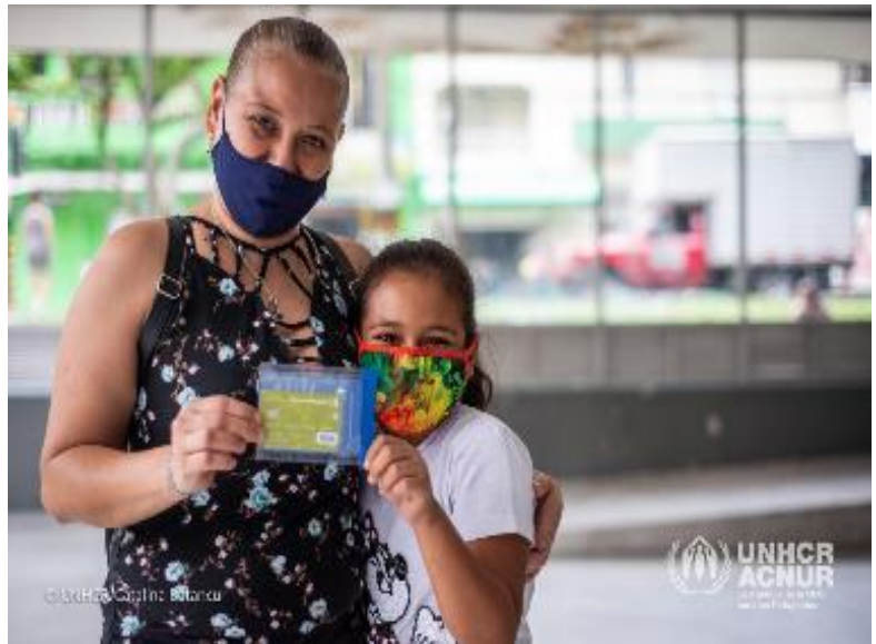
Cash assistance ©UNHCR Colombia.