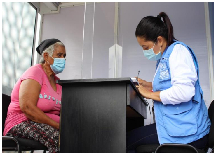
An information and Orientation Center (PAO) in Arauca.