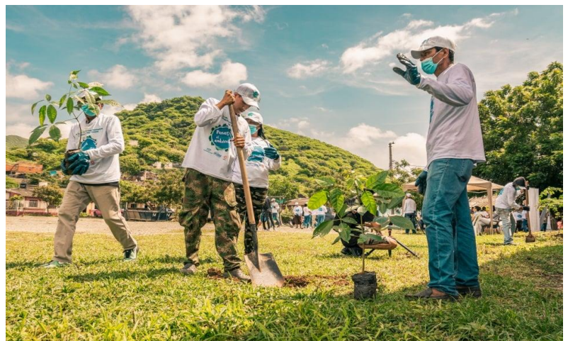
Environmental leaders in the city of Santa Marta are Colombians and Venezuelans who work for local integration through community care of the environment.