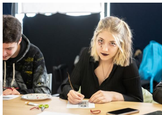
Teenager at a MHPSS workshop on art and health organized by WHO Cultural Mediators at 'Cattia' refugee centre in Brasov city