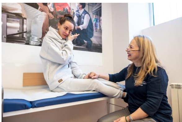
WHO Cultural Mediators providing services to a pregnant lady at WHO health clinic in Galati Blue Dot

WHO is also supporting 7 family-doctor clinics and collaborating with civil society organizations to provide free-of-charge primary-care services to refugees, including sexual and reproductive health care, and mental health and psychosocial support. Since June 2022, around 2,200 refugees have accessed these services.