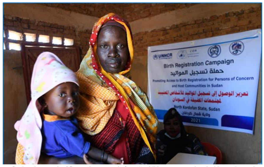
During the month of December, a total of 1,042 children were assisted with regular and late birth registration in North and South Kordofan and East Darfur states.