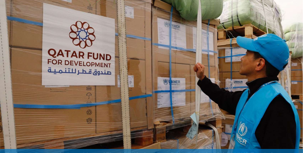
Thanks to support from the State of Qatar, airlifts of UNHCR winter core relief items arrive in Kabul