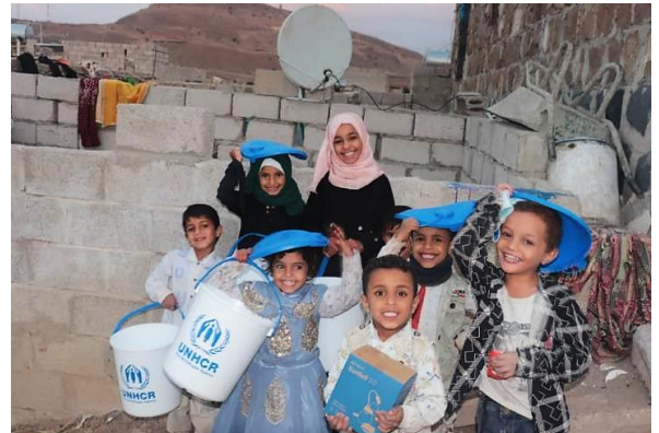
Ongoing conflict continues to generate new displacement across several governorates. During the reporting period, UNHCR distributed core relief items to newly displaced families in Marib and Sana'a governorates.

As hostilities escalate in Marib, UNHCR continues to provide lifesaving support to thousands of IDP families. Since the beginning of the year, UNHCR in Yemen has provided over 66,500 families with cash support and 18,500 families (110,000+ individuals) with non-food items (NFIs) and shelter assistance in Marib alone. Protection partners are also supporting individuals with legal assistance, particularly on personal documentation and housing, land and property rights, and with psychosocial support.