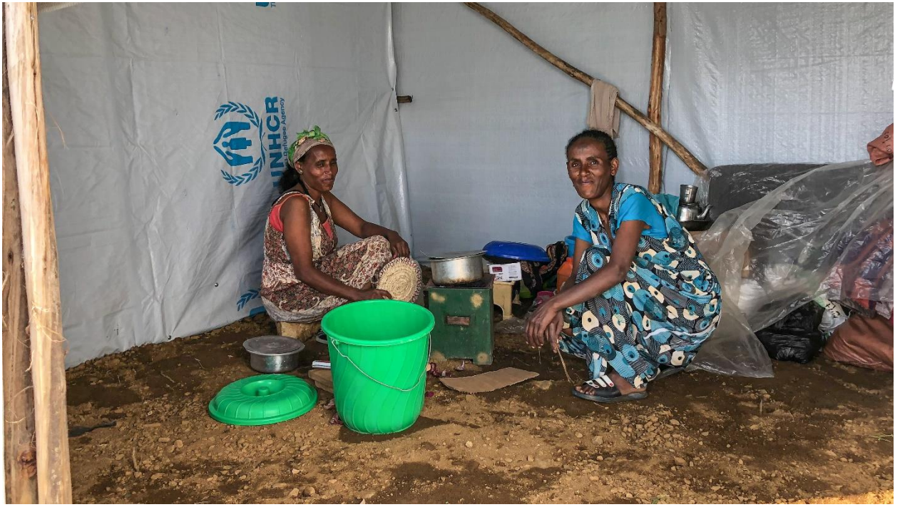
The relocation of internally displaced persons who had been hosted in schools to Sabacare 4, Mekelle, Ethiopia.