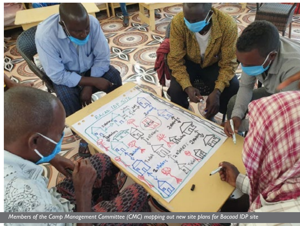
Members of the Camp Management Committee (CMC) mapping out new site plans for Bacaad IDP site

As a means of curtailing the effects of funding gaps, the CCCM cluster has worked closely with OCHA to identify local and international agencies that have a strong pedigree with interventions in IDP sites. Once identified, these agencies which have IDP site presence however have never administered CCCM, are targeted by the cluster to ascertain whether CCCM soft activities can be integrated within their current response packages. Once agencies agree to taking on such activities, the CCCM cluster provides a rigorous capacity building package ensuring that staff are trained on CCCM principles and are well equipped to implement CCCM cluster tools and templates at the site-level. This approach of integrating CCCM into currently funded response projects has allowed for greater coverage of CCCM assistance which has invariably had a positive impact for the humanitarian community. For example, the CCCM cluster in the first half of 2021 has been able to produce 16 district-level site verifications (most verifications on record for the cluster) in addition to extending the clusters footprint of COVID-19 RCCE activities reaching some 951 IDP sites nationally. Through this process of building up the capacity of agencies new to CCCM, two of these local partners were recently awarded CCCM funding via SHF for the first time in 2021.