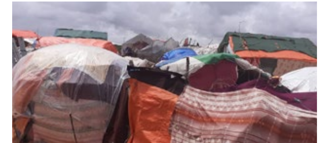
Congested state of Yaaqle IDP site prior to decongestion activities

As part of CCCM's mandate in responding with flood mitigation activities, CCCM cluster partners successfully carried out IDP site-level flood mitigation and prevention activities focused on strengthening drainage infrastructure in sites. In Afgoye and Daynile, a CCCM partner provided emergency drainage canal infrastructure in five IDP sites hosting 9,144 individuals drastically mitigating the incidence of rampant flooding within the settlement. Additionally, IDP site camp management committee (CMC) members were provided robust trainings on emergency management and flood mitigation tactics for better community planning. The activity included the provision of disaster-risk reduction tool kits provided to CMCs and site maintenance committees (SMCs) that supported with the creation of drainage infrastructure to assist members of the community in maintaining clear drainage basins and promoting protected settlements. Likewise in Kismayo, 35 IDP sites in the Dalxaska hosting 19,168 IDPs were supported with flood mitigation and response activities aimed at promoting greater community resilience on the topic via capacity building and infrastructure development initiatives.