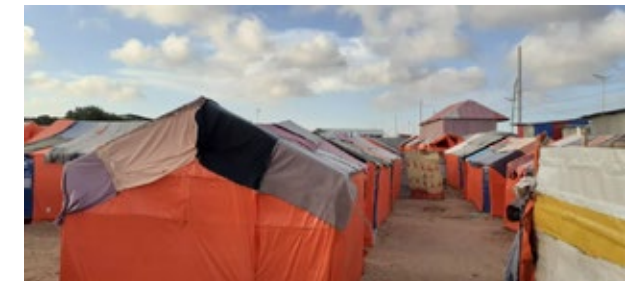
Yaaqle IDP site following the site decongestion activity