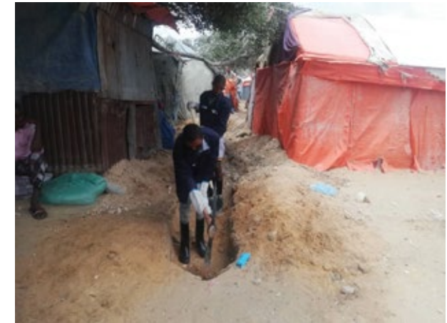
Flood response activities in Afgoye