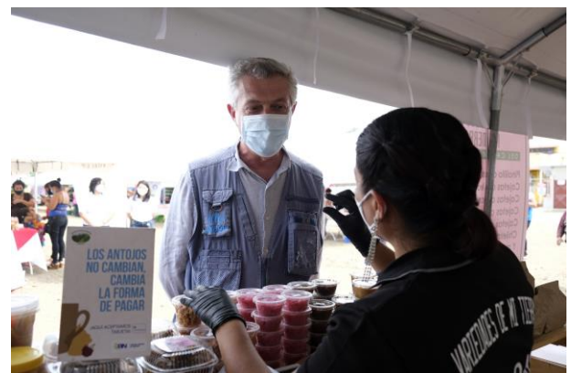
Thirty-year-old Nicaraguan asylum-seeker meets UN High Commissioner for Refugees Filippo Grandi at her stall at a market in Upala near Costa Rica's border with Nicaragua. She received training and financial support from UNHCR's partner Fundación Mujer to be able to sell sweets using recipes from home.

Asylum countries and communities have shown great solidarity with Nicaraguan refugees and asylum-seekers, and it will be key to keep supporting them as they ensure protection and promote local integration of Nicaraguans amid a challenging pandemic context. UNHCR has renewed its call on the international community not to turn a blind eye to the plight of Nicaraguan refugees and asylum-seekers, as the pandemic exacerbates their vulnerabilities and needs.