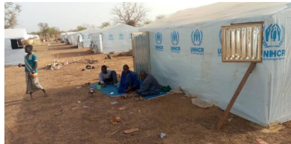
Emergency shelter built on IDPs hosting site.