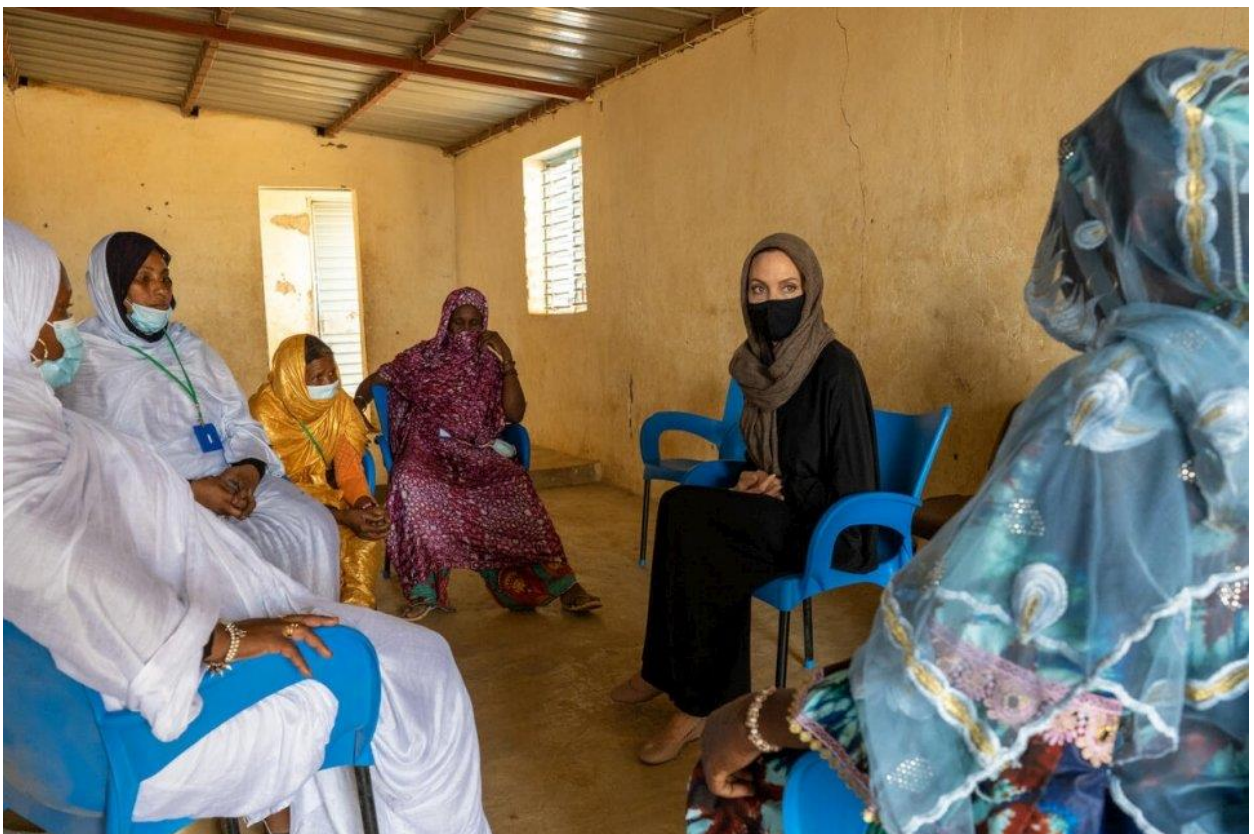
The Special Envoy of the High Commissioner for Refugees, Ms. Angelina Jolie speaks to refugee women at the Goudoubo refugee camp on World Refugee Day