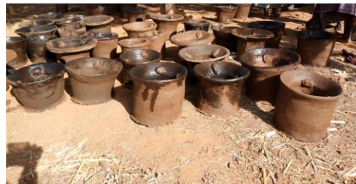
Improved cookstoves produced by IDPs and host community women in the Center-North.