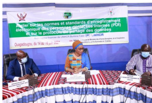
From left, UNHCR Representative, the Minister of Women, National Solidarity, Family and Humanitarian Action and the Permanent Secretary of CONASUR, during the workshop on norms and standards for electronic registration of IDPs.