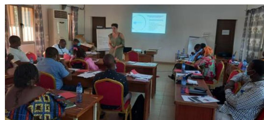
Training of UNHCR staff in Kaya on AAP and Protection from Sexual Misconduct.