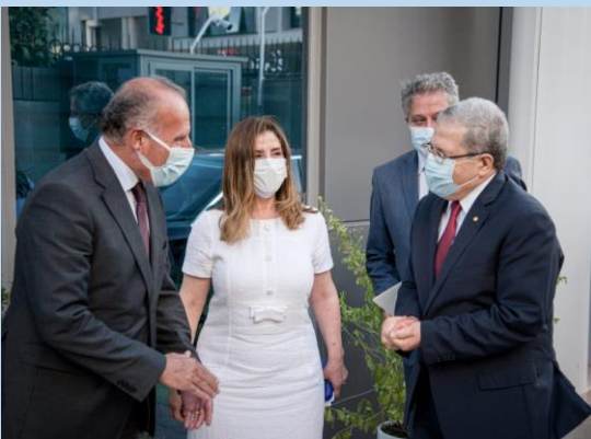
UNHCR Regional Director and Representative in Tunisia greet Minister of Foreign Affairs Othman Jarandi at new UNHCR premises in Tunis.