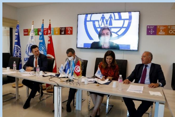
Signature of MoU with IOM in the presence of UN Resident Coordinator