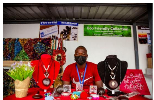
A refugee exhibitor at the refugee exhibition fair organized by UNHCR at the refugee community centre-Blue Oasis.