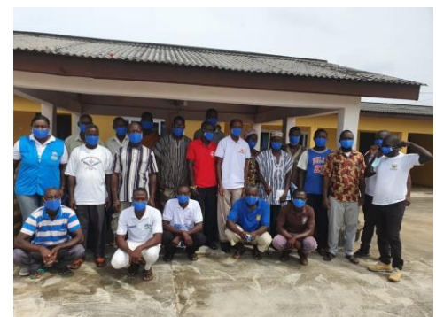
The Chief of Ampain together with his elders wearing the masks donated by UNHCR.