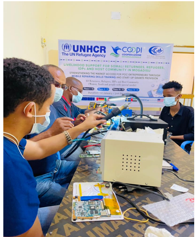
As part of UNHCR's livelihoods initiative, participants in a mobile phone repair workshop at COOPI in Mogadishu