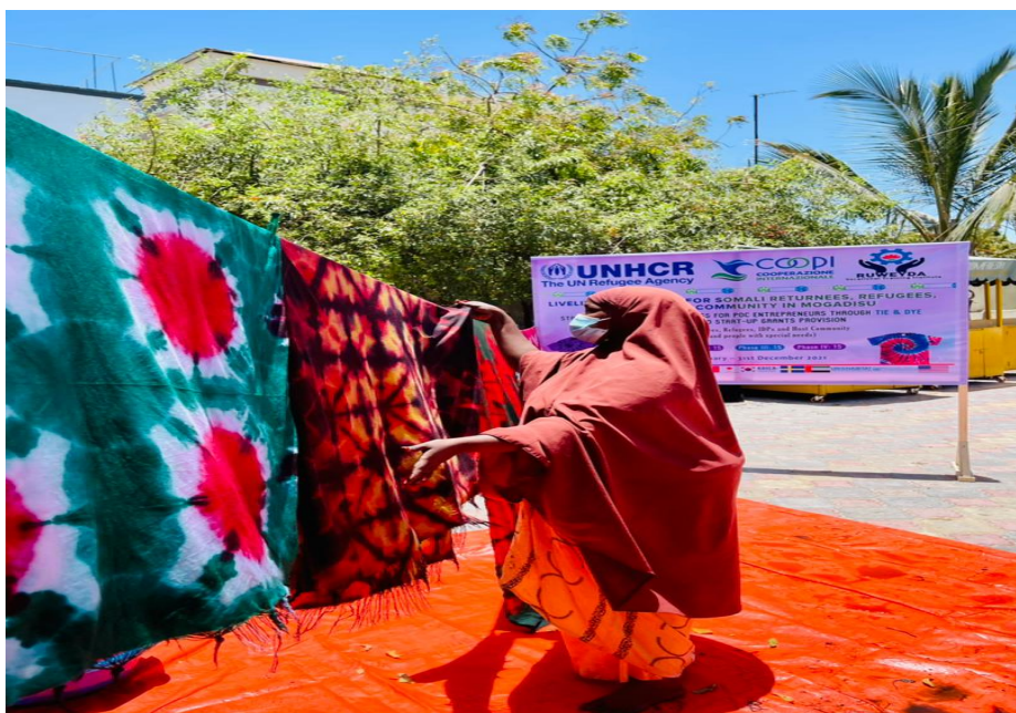
As part of UNHCR's livelihoods initiative, a woman participates in a tie-dye practical session with partner COOPI in Mogadishu

The new wave of COVID-19 continued to affect the country in March. The government announced several new measures in an attempt to control the spread of the virus, including a ban on all public gatherings and closure of schools and universities. UNHCR responded to the authorities call for support by distributing various medical equipment and tents to strengthen the prevention and response to the virus.