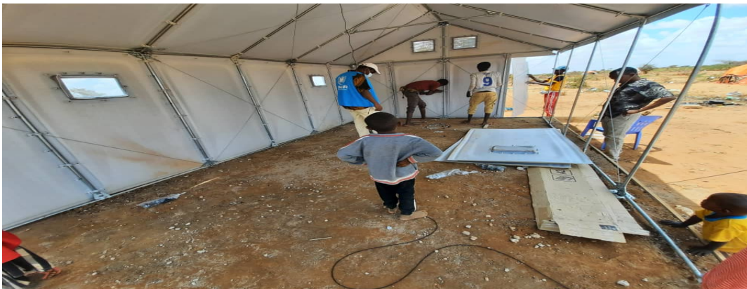
The construction of 50 Refugee Housing Units (RHU) ongoing in Qansaxley IDP camp in Dollow.

The Shelter Cluster partners have no shelter stocks available, and only very limited NFI stocks, whereas the needs remain vast.