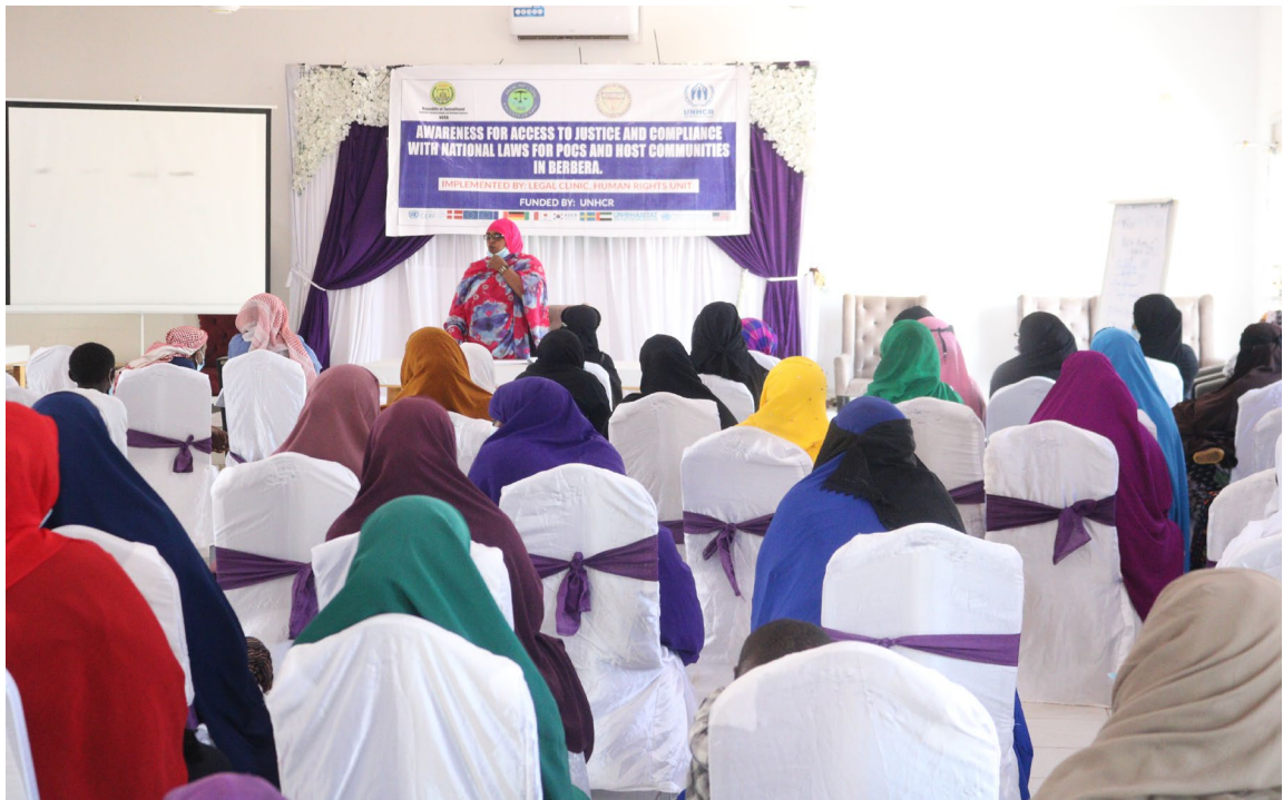
UNHCR partner Legal Clinic held a SGBV awareness-raising for PoCs and host communities in Berbera, Somaliland.