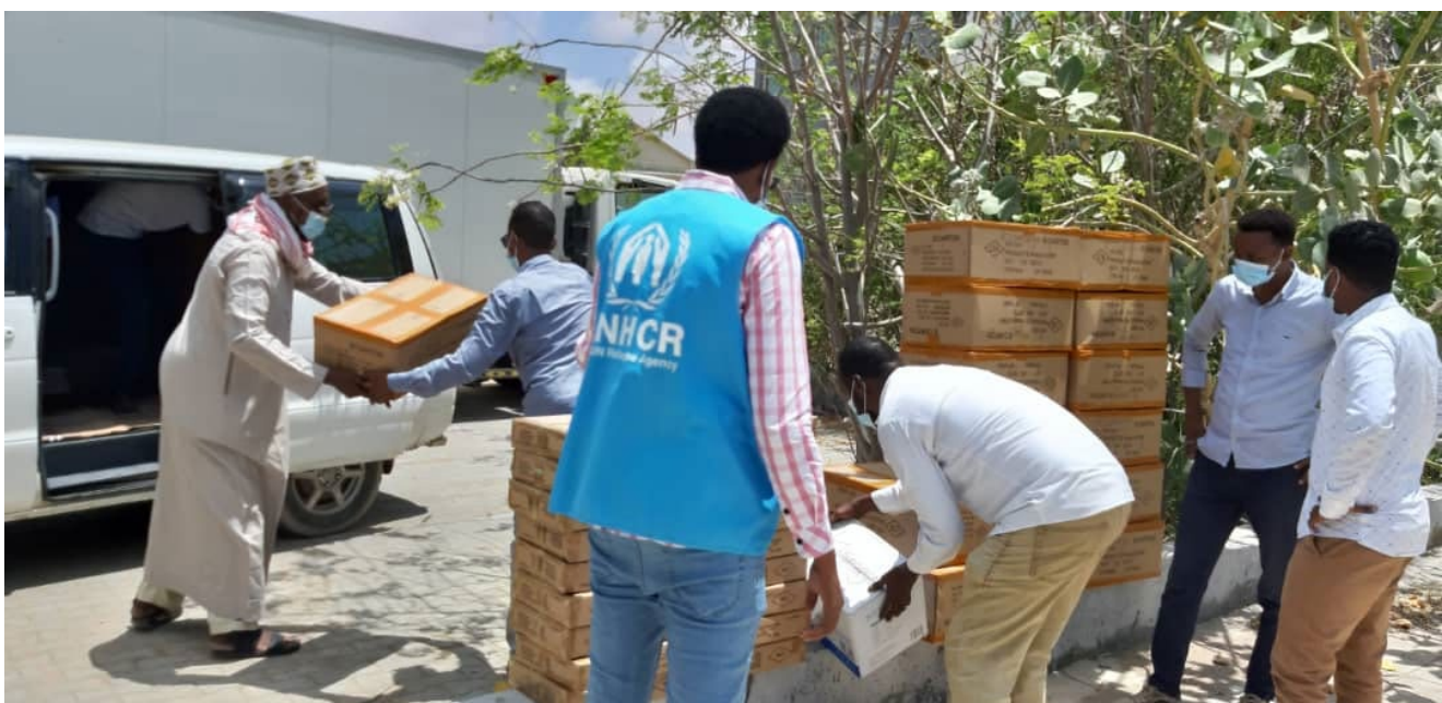
UNHCR staff handing over disposable face masks to health authorities in Jubbaland.