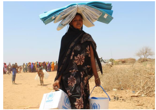
A young woman carries home some critical relief items which UNHCR recently distributed to 200 displaced families at the Wabi-Ugur IDP site in the Somali Region.