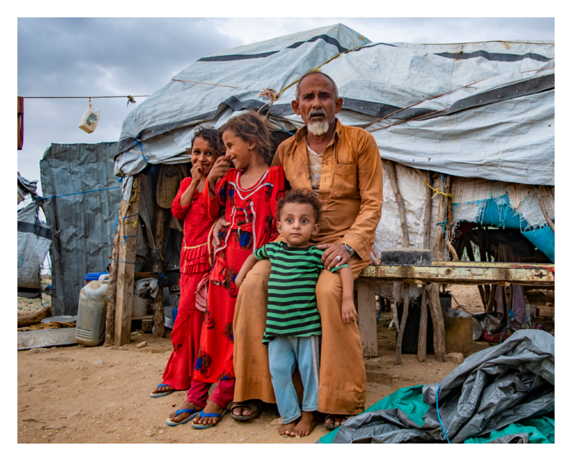
A vulnerable displaced Yemeni family currently living in an IDP hosting site. One of the more than 200,000 Yemeni families that benefitted from UNHCR cash support throughout the country in 2020.

Country-wide, UNHCR addresses the immediate needs of vulnerable IDP families by providing basic household items, shelter options, and cash assistance to help families afford food, healthcare, rent, and additional winter clothes. UNHCR further ensures IDPs have access to protection services such as legal counselling, psychosocial support, and prevention of gender-based violence, and encourages social cohesion with the host communities by implementing community projects and improving services at IDP hosting sites. These projects include the rehabilitation of vital infrastructure such as hospitals and schools, among others.