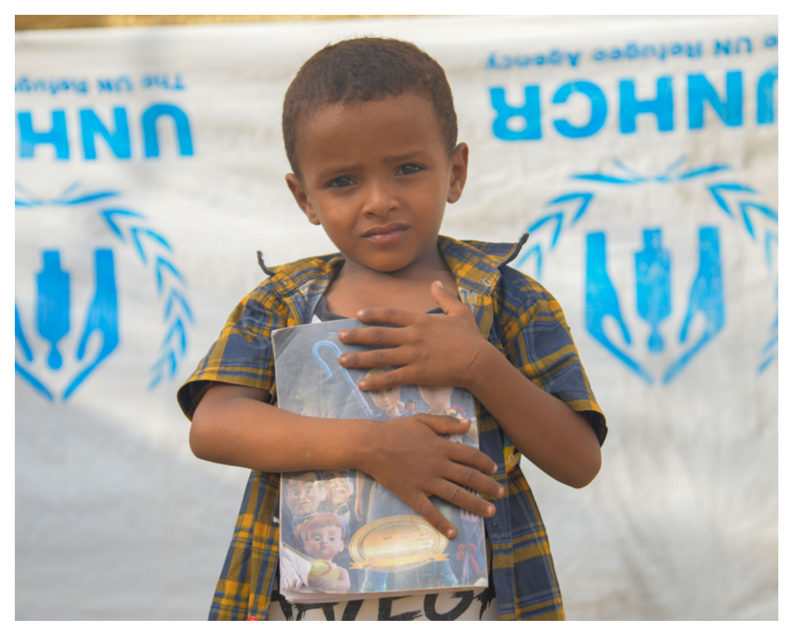
A 12-year-old child going back home from school in Al-Hudaydah Governorate, Yemen. UNHCR supports refugee children to ensure enrolment in primary and secondary education.

UNHCR is the lead agency for ensuring the protection and well-being of 137,000 refugees and asylum-seekers across Yemen, mainly from Somalia and Ethiopia. UNHCR also co-leads with IOM the Refugee and Migrants Multi-Sector for refugees and asylumseekers. Refugees are registered on a regular basis and provided with assistance in a wide range of areas including access to documentation, legal assistance, food, prevention of gender-based violence, cash assistance, and referrals to other critical services such as health and education, among others.