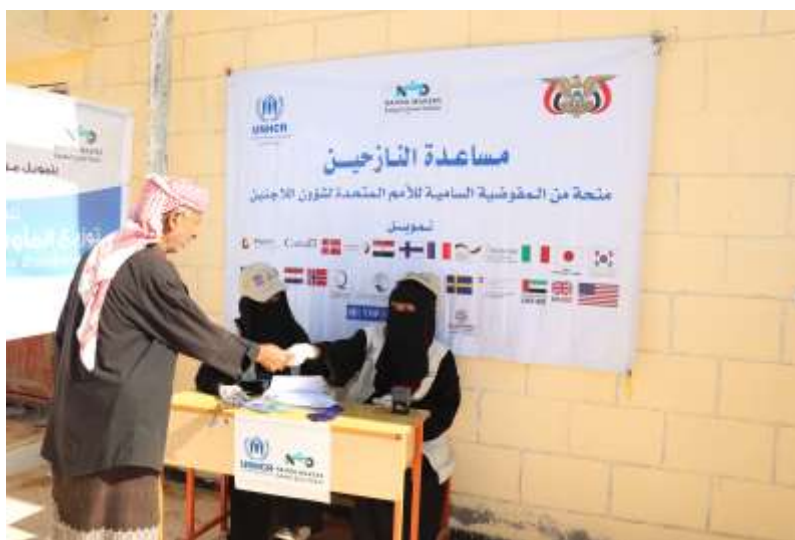
A displaced man hand over his ID at a non-food items distribution site in Abyan.

UNHCR partners in the south included: Al-hikma Al-yamania Association for Charity (HYAC), Field Medical Foundation (FMF), Human ACESS (previously Charitable Society for Social Welfare (CSSW)), the International Organization for Migration (IOM), INTERSOS, Al-Magd Charitable & Humanitarian Relief & Development (MCHR), Nahdha Makers Organisation (NMO), Norwegian Refugee Council (NRC), Society for Humanitarian Solidarity (SHS), UNICEF and the UN World Food Programme (WFP).