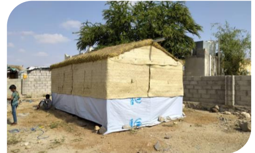
An example of a Tehama Enhanced Emergency Shelter Kits (TESKs) unit in Az Zuhrah district, Al-Hudaydah governorate. UNHCR recently completed the distribution of over 1,455 TESKS across al-Hudaydah and Hajjah governorates.

During the reporting period, more than 1,000 IDPs were assisted with core relief items (CRI) in Al-Dhale'e, Hadramaut and Al-Hudaydah governorates. CRI items included mattresses, blankets, water buckets, solar lamps and mosquito nets. Additionally, some 500 conflict-affected IDPs were provided with transitional shelters to meet their immediate shelter needs.